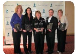
BBB Staff Accepting Five International Awards